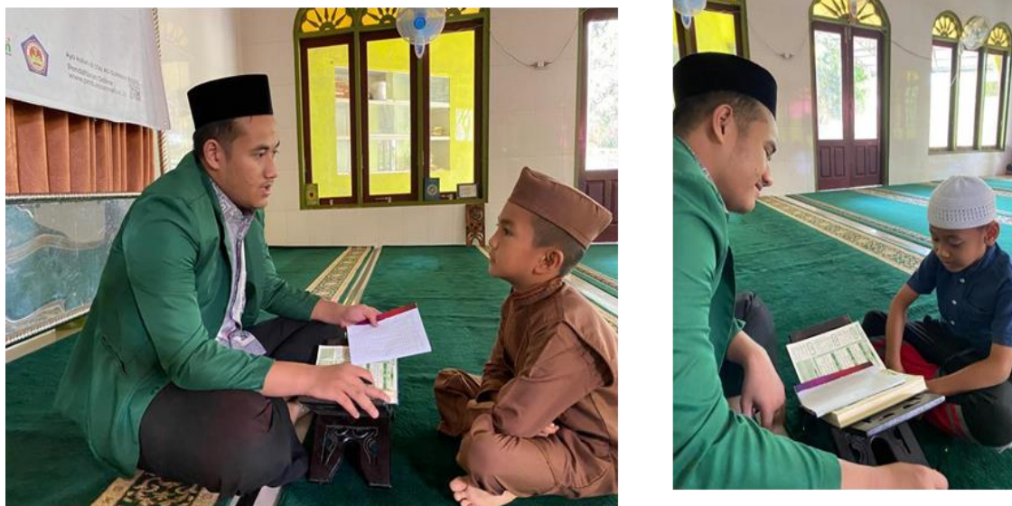
Picture 4. Memorization and murojaah activities

The systematic activities that we carry out are (1) modeling the reading of short surahs per verse. (2) asking participants to follow the teacher's reading and start memorizing. (3) asking participants to deposit their memorization at the next meeting. This one activity program starts with memorizing the last surah in the Qur'an, namely surah An-Nas , then goes back to the previous surah, Al-Falaq .