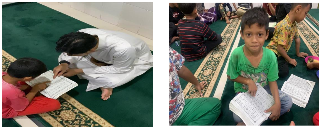
Picture 3. Iqra' learning activity with village children

It is known that a person will not be able to read the Qur'an properly and correctly according to the rules of reading if he has never learned and knows the basic knowledge in reading the Qur'an, namely about Makharijul Letters. Therefore, in this program, we strongly emphasize and focus on the material on how to pronounce the hijaiyyah letters. In Makbraj material, children are trained to pronounce letters according to their nature and place of release from Alif, Ba', Ta', Tsa to Ya.' The teaching methods are 1) Modeling letter by letter. 2) Children listen and imitate in turn. 3) Inviting children to ask questions if there is still an explanation that has not been understood.