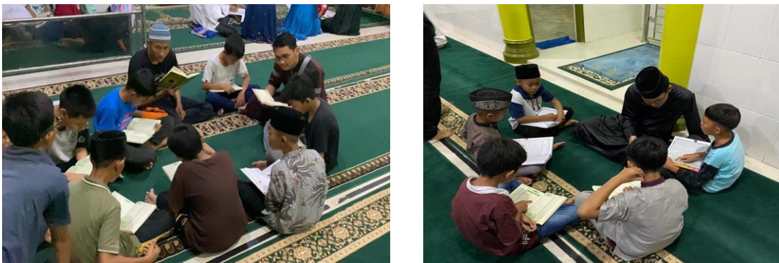
Picture 2. Tabsin Tilawah activity

The steps taken in this tabsin tilawah program are as follows: (1) Identifying the ability to read the Qur'an in elementary school children in Sidoharjo Village 1 Pasar Miring. (2) Develop an implementation plan for the tabsin tilawah programme. (3) Implementing the tabsin tilawah programme. (4) Evaluating the tabsin tilawah programme. However, in this program, we have not emphasized and explained the details of the reading laws, such as Ikhfa' Syafawi , Idgham Mutamatsilain , Izhar Syafawi , and Sukun . However, we only explain the outline and focus more on practice than theory.