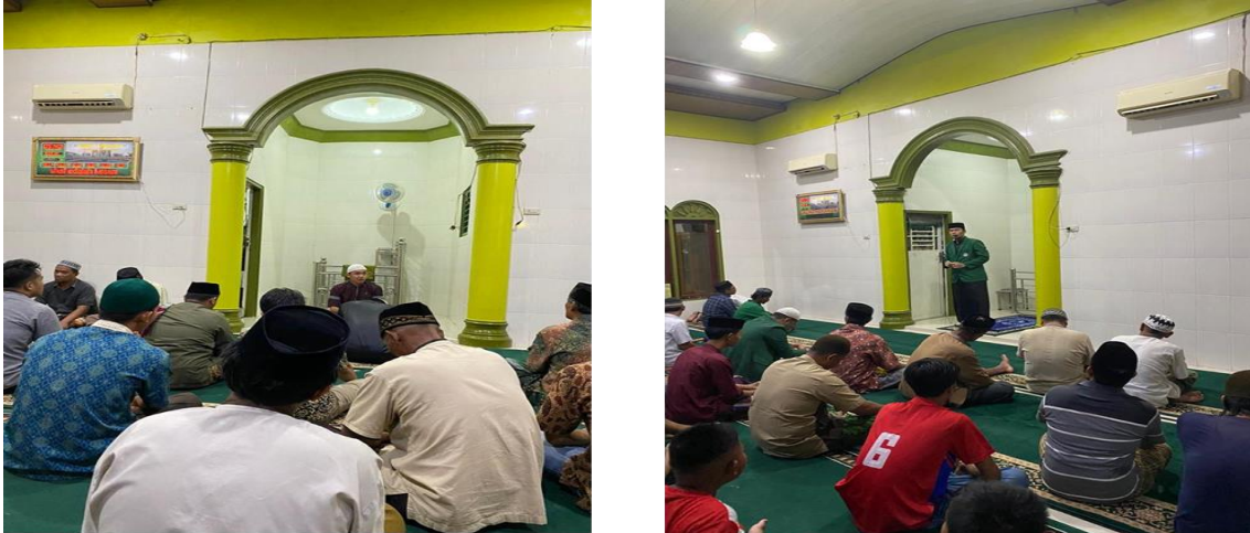
Picture 5. Ramadan lecture activity

Based on the observations of the STAI As-Sunnah Community Service Program team in the field, it was found that the ability of the community, especially children in Kaloling Village, to read the Qur'an was very low due to the influence of smartphones at this time. Therefore, to improve the ability to read the Qur'an in Kaloling Village, a da'wah Safari program was held to increase the motivation to learn the Qur'an.