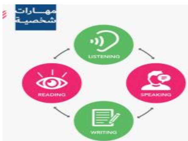
Figure 1. Language Competence 15,16

Based on the explanation above then the urgency of Arabic, especially for Muslims, needs to be instilled in the younger generations to master Arabic. Mastering Arabic is not only able to read, listen, and understand, but also must be able to make Arabic a spoken language or language of communication. Schools based on good madrasa learning that study Arabic are required to be able to master Arabic well. Mastering Arabic means that students must have all aspects of ability in a language, including Arabic, namely: maharah qiraah , maharah kitabah , maharah istima' , dan maharah kalam . 14